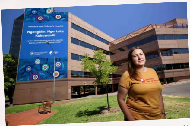
InDaily | 15 January 2022